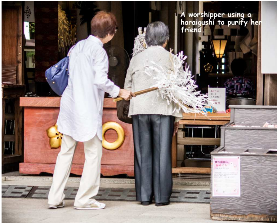
A worshipper using a haraigushi to purify her friend.