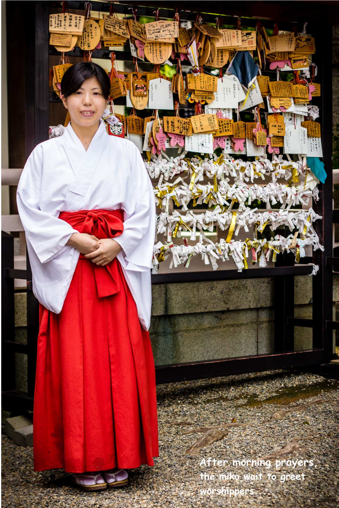
After morning prayers, the miko wait to greet worshippers...