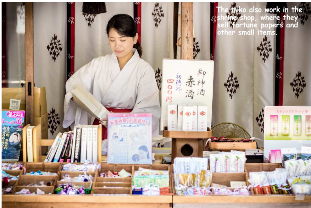
The miko also work in the shrine shop, where they sell fortune papers and other small items.