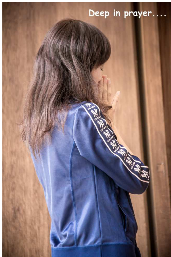
Deep in prayer....