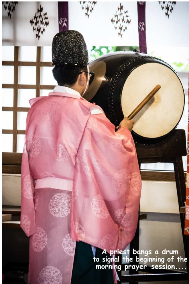
A priest bangs a drum to signal the beginning of the morning prayer session....