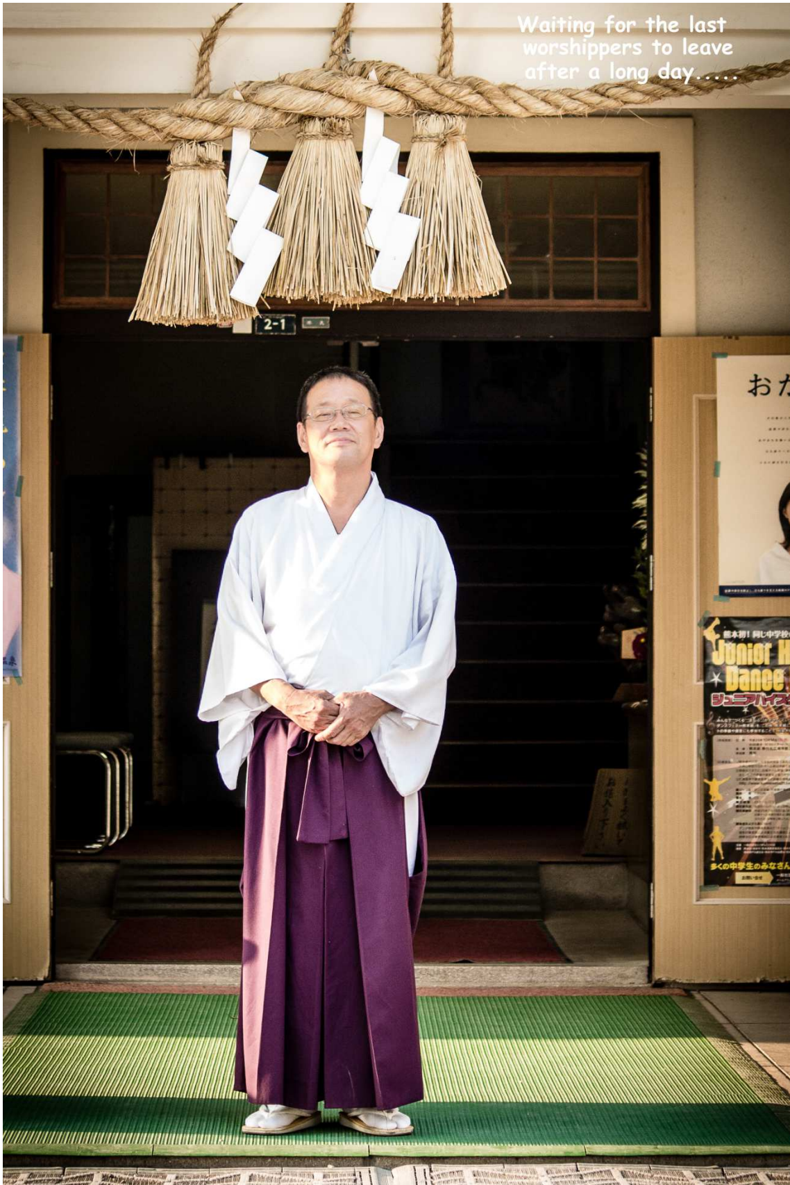
Waiting for the last worshippers to leave after a long day.....