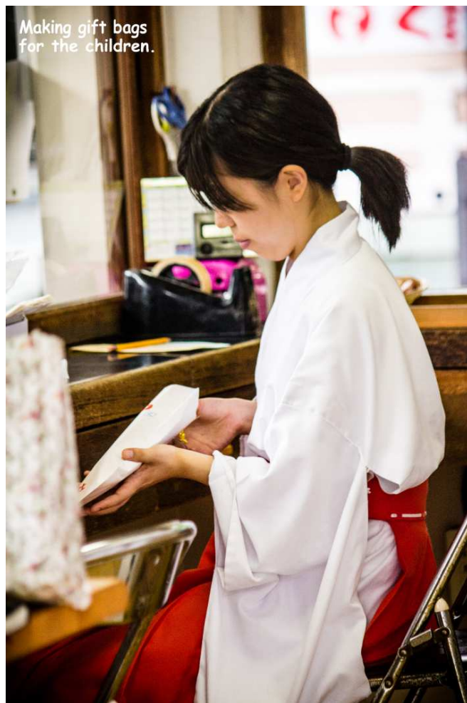
Making gift bags for the children.