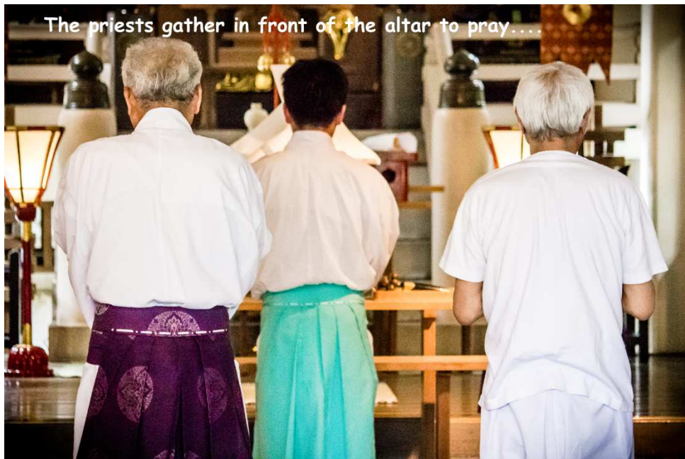
The priests gather in front of the altar to pray....